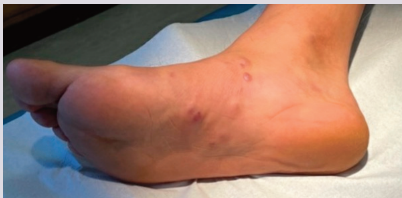
Figure 1 Photograph of right foot showing painful growing lumps on the medial aspect of the foot.

The MRA (Figure 2) showed distinct but communicating lesions with arterial supply and early venous drainage, suggestive of an arteriovenous lesion. A specialist multidisciplinary team (MDT), consisting of dermatology, vascular, diagnostic and interventional radiology experts, considered the lesions too high flow (ie, arterial) for sclerotherapy and recommended a diagnostic angiogram with a view to possible endovascular embolisation.